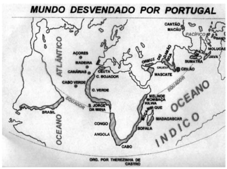
Figure 1: World Discovery by Portugal