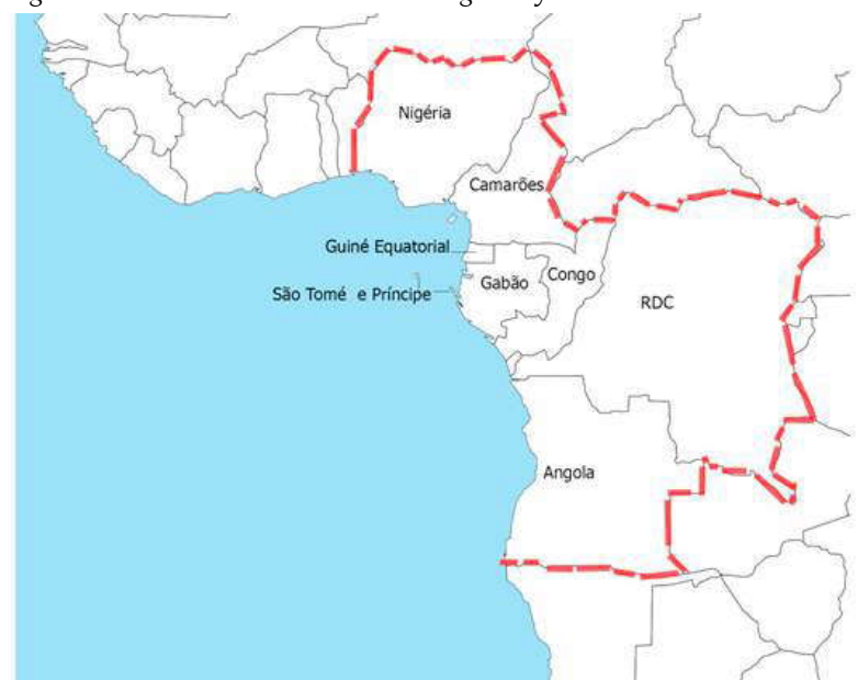
Figure 4: Gulf of Guinea Commission Signatory Countries.

The initiative to create the GGC meant, first of all, awareness of the importance of the Gulf of Guinea as world producer of oil implying, as a consequence, a new regional and continental political-strategic realignment. Figure 4 below shows the countries that are members of the GGC: Angola, Cameroon, Gabon, Republic of Equatorial Guinea, Democratic Republic of the Congo, Republic of the Congo and São Tomé e Príncipe, GGC countries. Bringing together countries of central and western Africa, the GGC en bloc, produces more than five million barrels of oil per day (ROYAL..., 2012).