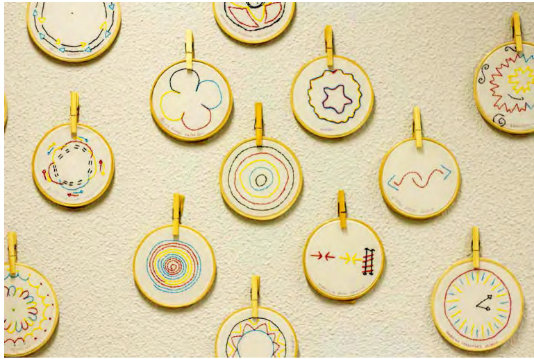
Figure 3 Outcomes of the 2nd experience