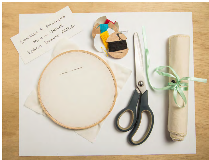
Figure 1 Materials used

Starting with the class' movement itself, we gradually introduced the proposal and, step by step, the students accepted invitations to a different, more detailed, movement that required new skills, such as to thread yarn through needle, and this lasted until our next meeting, when the invitation to another dance was asked.