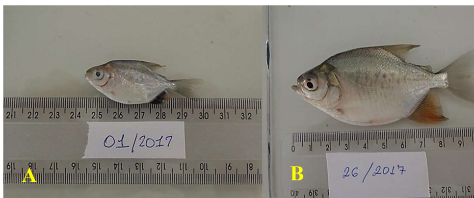
Figure 02: A) Experimental specimen. Note the low growth when compared to the same age specimen kept in the excavated nursery. B) specimen kept in excavated nursery.

In the tank samples that were necropsied, the presence of monogenoids was also observed, however, no visible signs of disease or deficiency were observed and the biometric data were superior to those of the experimental animals (Fig. 02, A and B). SOBERON et al. (2014) report a small increase in the blood glucose levels of tambaquis parasitized by Anacanthorus spathulatus Kritsky, Thatcher & Kayton, 1979, which can be an important indicator in the production of hormones such as cortisol and adrenaline related to stress in fish captivity. However, the authors did not observe any signs of physiological alteration in the fish. They state, agreeing with GODOI et al. (2012), which that good breeding management is essential for the control of parasites, since, present in low quantities, they are not able to interfere in the health of the fish. Changes in blood glucose level were also observed in the work of ROCHA et al. (2018).